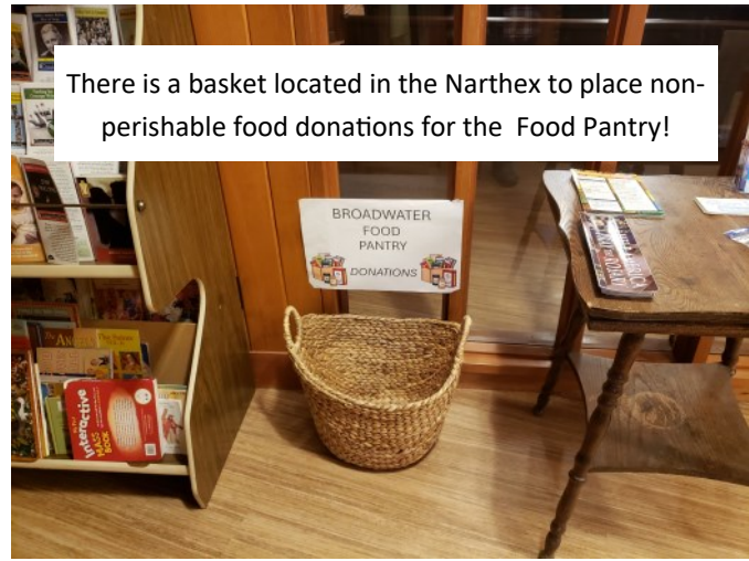
There is a basket located in the Narthex to place non-perishable food donations for the Food Pantry!

YOUTH HIGHLIGHTS 3/23/25 RE topic: Mass (structure) Mark your calendars: High schoolers are encouraged to take part in the CYC Convention/Eucharistic Congress March 21-23.